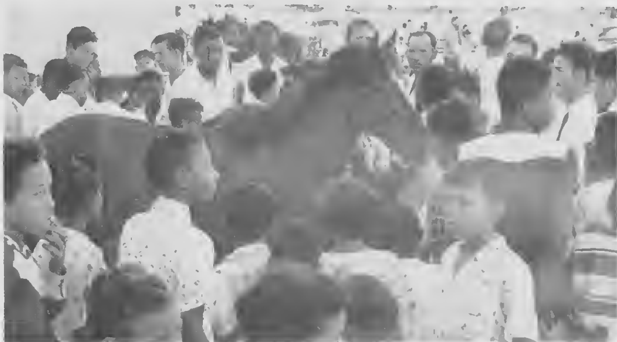
EAGER FOLLOWERS gather around the injured Prince. The horse tripped while racing and it was ascertained that he had broken his leg. Later the animal was mercifully destroyed.